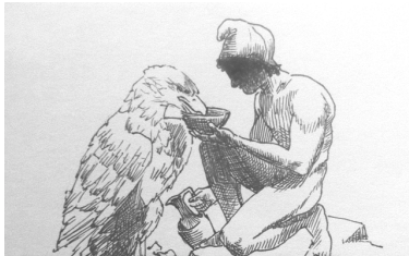
___ No. 38:

Use the visuals below to answer questions No. 38, 39, and 40.